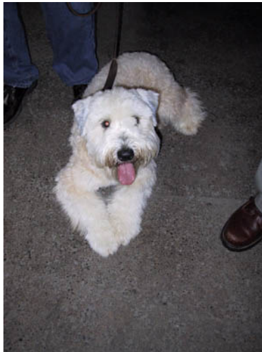
Noted numismatist Grady Gottfried enjoys the 2001 RNA picnic, with help from Dinosaur BBQ